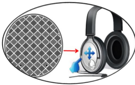
Gesture headset - touchpad