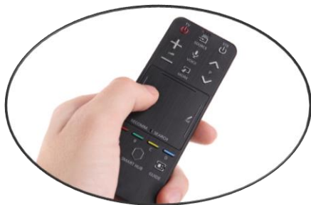
Remote Control Trackpads

Examples of these applications can be seen in the pictures below.