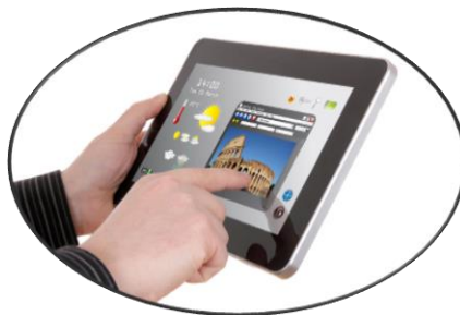
SAR sensor for tablets

The next page will show more picture examples of successful applications.