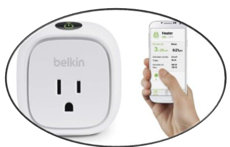
Power Tracking Wall Switch