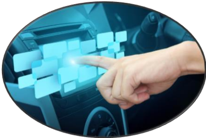
Car DVD Controls