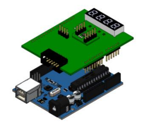
IQS622 Shield + Arduino Uno - sold separately