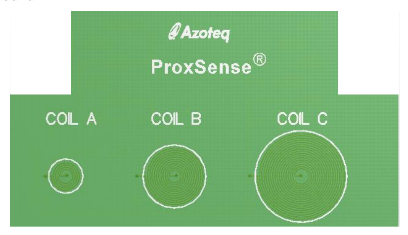
Figure 3.3 Inductive Board

Upload: IQS269A_AZP985A03_Inductive_V1.0.0 The inductive board has one mode: coil mode