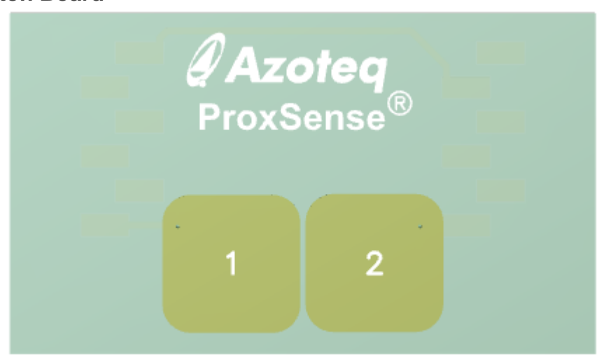
Figure 3.1 Two Button Board

Upload: IQS269A_AZP985A03_2button_V2.3.0