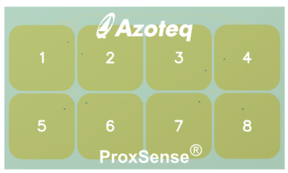
Figure 3.2 Eight Button Board

Upload: IQS269A AZP985A03 8button V2.3.0