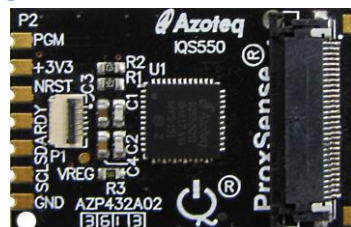
Figure 2 IQS550 module board

It is recommended to evaluate a solution using the Azoteq CT210. The USB device communicates via I 2 C with the module board. Use this method to evaluate performance and explore the vast amount of custom settings available on the IQS550. The standard IQS5xx GUI may be used while consulting the AZD070 application note for connection and GUI details.