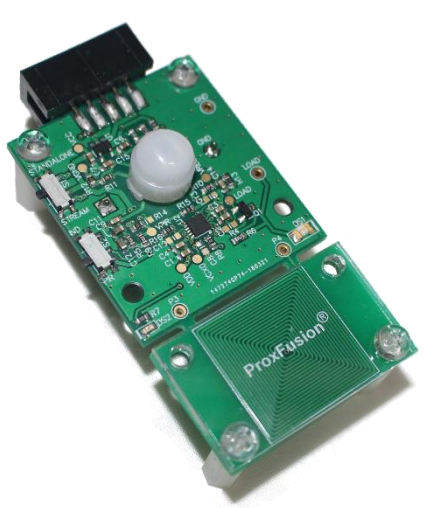
Figure 1: IQS680EV_02